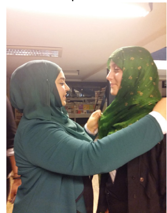
Two young participants

What was brought home: Peace depends on each of us; concrete action as well as advocacy is needed. Politicians realised they need